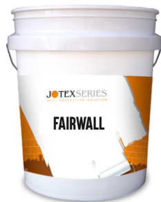
Colour: White Only

Use under well ventilated conditions. Do not breathe or inhale mist. Avoid skin contact. Eyes should be well flushed with water and medical attention sought immediately For detailed information on the health and safety hazards and precautions for use of this product, we refer to the Material Safety Data Sheet.